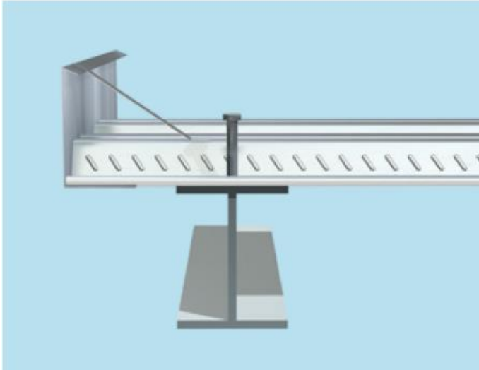
Image 4 – Typical Edge Form Profile Layout with cantilever. Edge form held square with restraint straps

block or concrete walls, or 4mm diameter power activated drive pins with a washer fitted on steel beams, or self-tapping screws directly to the decking sheets.